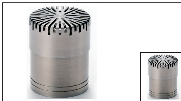
Fig. 1 1/2" Free-field Microphone Type 40AZ (inset shows true size)

The G.R.A.S. 1/4" High Impedance preamplifier Type 26CG (input impedance = 40 GΩ)* is available for use with Type 40AZ (see data sheet for Type 26CG). The mounting thread (11.7 mm - 60 UNS-2) is compatible with microphone preamplifiers for WS2P/F microphones.